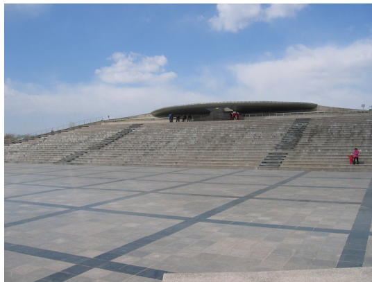
Fig.1. Large square of a small town in BeiJing

The most obvious difference between the small towns and large cities is reflected on the space scale whose rationality affects the dimension of the small town. It is not advisable to construct blindly without the consideration of concrete circumstances and imitate the large scale of big cities. But after our investigation we found that the misadjustment of public space existed in many towns. For example, some towns built particularly large squares about ten thousands square meters, which exceed the need of the town residents. What's more, most squares use hard paving tile and lack green facilities, which are unfavorable to both the residents and the environment.