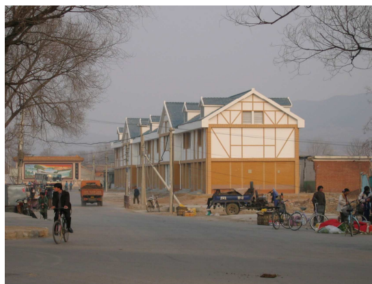
Fig.2. Different architecture styles in the same street

Different distribution and style of architecture constitute different environmental forms and space characters which are the direct expression of substance landscape of the towns. But many small towns are in difficulties of ordinary looking because of lacking of urban design. Some marked buildings are been sought with new and modern styles in their own way but without the consideration of the whole environment. At the same time, large numbers of common buildings are in the service of function, lacking plastic design. Some buildings using china brick as facade material, look like matchbox without expression. What's more, the composition of the buildings are short of the different local styles. There are both the Chinese and foreign styles in architecture designs and the color of buildings looks dull or disordered. All that above can not reflect the local characters.