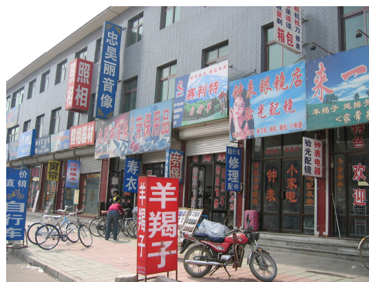
Fig.3. Disordered advertisement boards which make the town buildings look improper

Furthermore, the advertisement board needs macroscopic control and many kinds of facilities are different in scale, color, material and position, which made the town buildings look improper, influencing the whole view of the town.